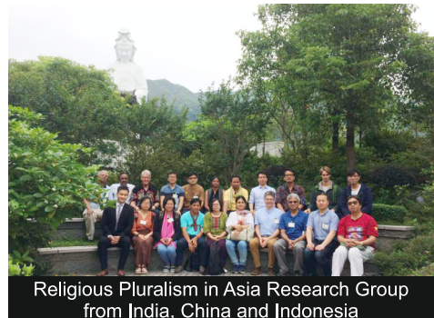
Religious Pluralism in Asia Research Group from India, China and Indonesia